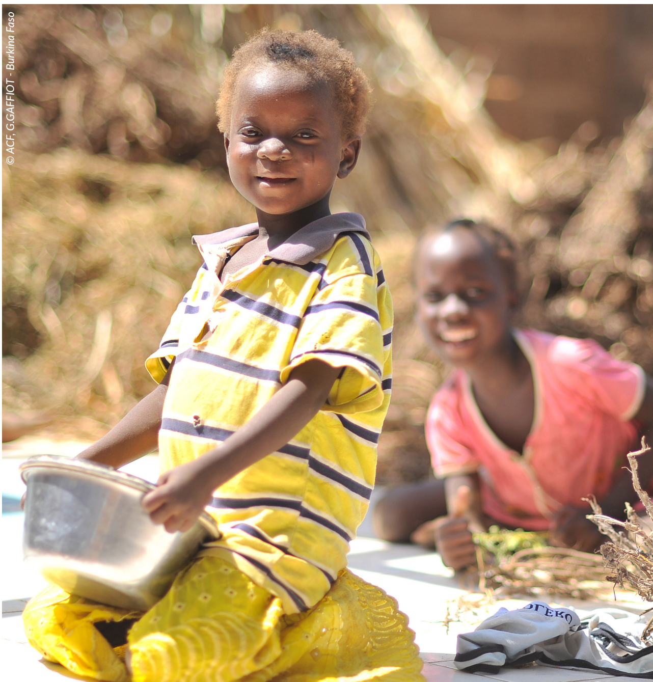
© ACF, G.GAFFIOT - Burkina Faso

→ Raise awareness on two of the greatest external threats to nutrition: climate change in Goal 13 and conflict in Goal 16