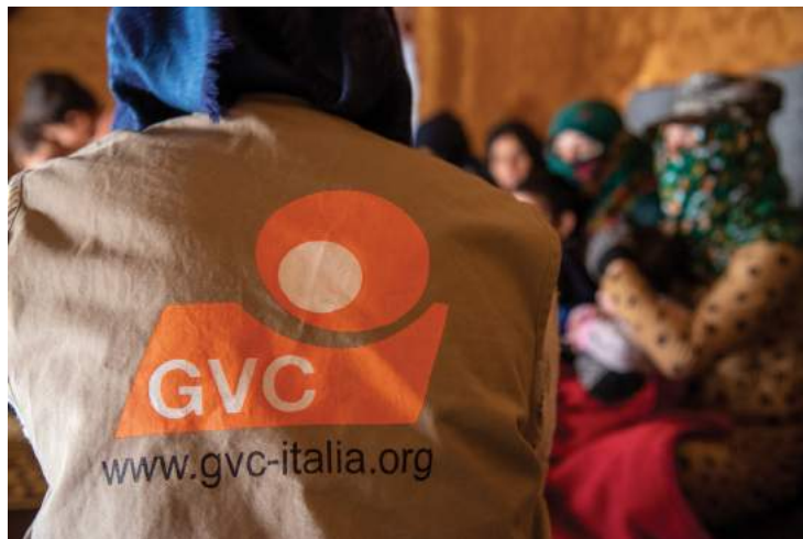
Interview of the inhabitants of the household with GVC staff