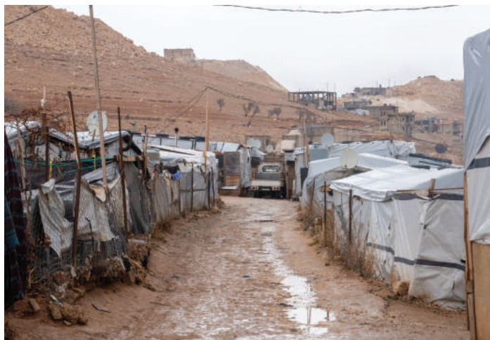
A group of tented settlements flooded as a result of heavy rain storms in Aarsal in January 2020

Access to education for Syrian refugees also remains challenging. In addition to the lack of school capacity to absorb more children in areas with a high concentration of refugees, cost-related reasons are the most common barriers to education. As a result of the current economic crisis, there may be an increase in numbers of Lebanese students who were previously in private schools, integrating into public schools.