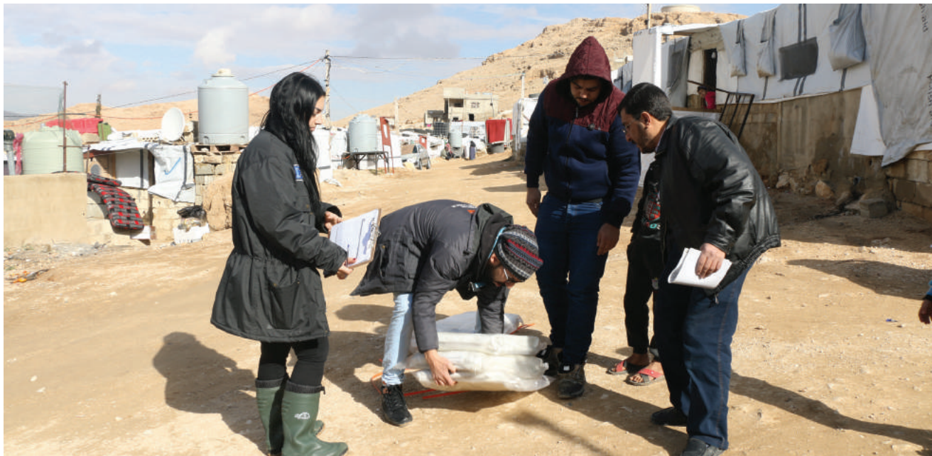
Moayed receiving a shelter kit from NRC

'I want to go back to Syria but it needs to be safe and stable so that we can work and rebuild our home. When safety can be guaranteed and conditions allow for it, I will take my family and return home.'